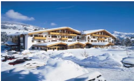
Active Sunny Hotel Sonne Seestraße 15 6365 Kirchberg bei Kitzbühel