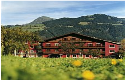
Hotel Kitzhof Schwarzseestr. 8-10 6370 Kitzbühel