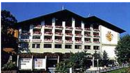
Hotel Tiefenbrunner Vorderstadt 3 6370 Kitzbühel