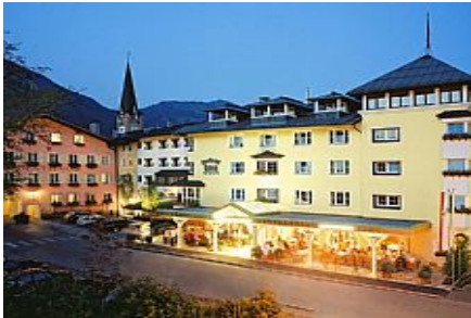
Sporthotel Mayr-Reisch Franz Reisch Strasse 3 6370 Kitzbühel