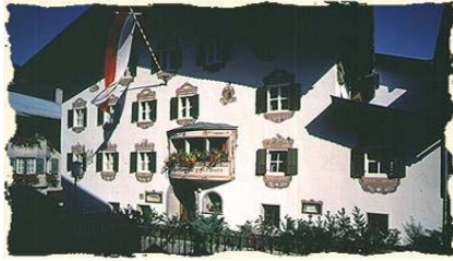
Gasthof Eggerwirt KG Gänsebachgasse 12 6370 Kitzbühel