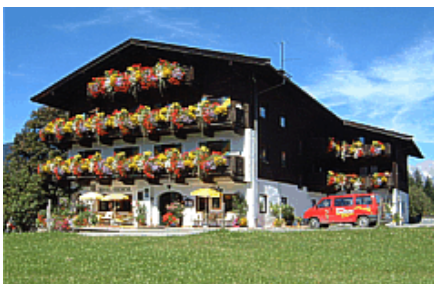
Hotel Seebichl Seebichlweg 37 6370 Kitzbühel