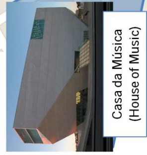
Casa da Música (House of Music)

Hotel Tuela Rua Arq. Marques da Silva, 200 4150 - 483 PORTO