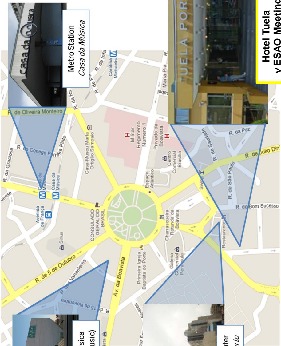
Metro Station Casa da Música