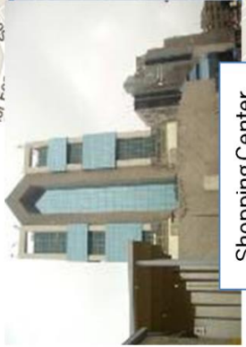
Shopping Center Cidade do Porto